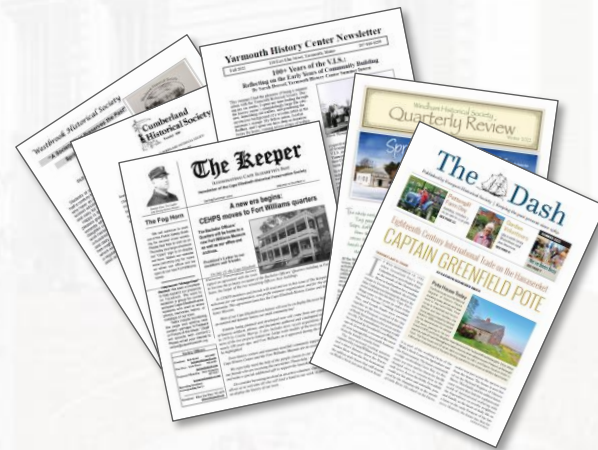
Other Society Newsletters