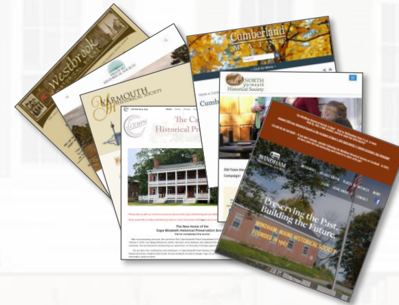
Other Society Websites