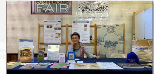
FHS Table at Public Events