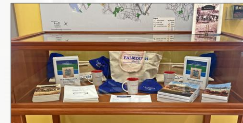
Falmouth Town Hall