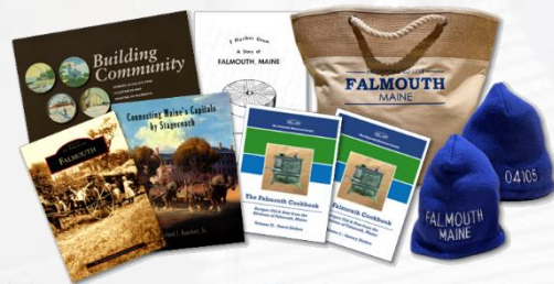
The Falmouth Heritage Bookstore