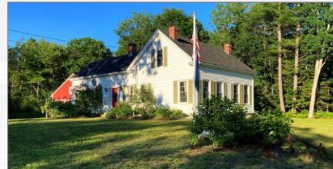
Falmouth Heritage Museum