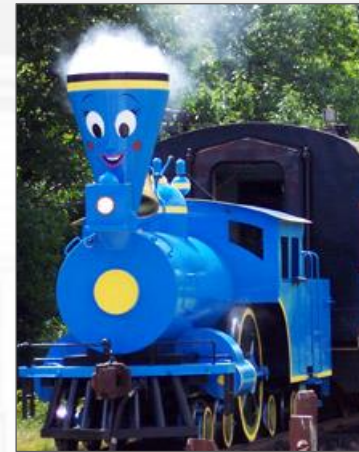
The Little Engine That Could